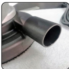
Integrated exhaust function