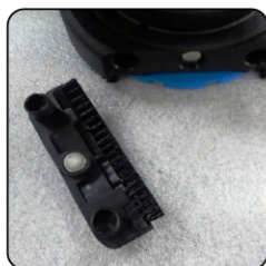
Toolless detachable brush segment (magnetic)